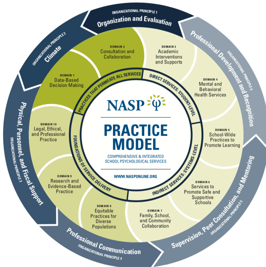
Figure 1. The NASP Practice Model

The Model for Comprehensive and Integrated School Psychological Services (the NASP Practice Model) describes the services provided by school psychologists to students, families, and schools. The model generally does not differentiate the services provided by school psychologists prepared at the doctoral and specialist levels. Rather, the model promotes a high level of services to meet the academic, social, behavioral, and emotional needs of all children and youth. It may be noted, however, that work experience, advanced graduate education, and professional development may result in specific skills and advanced knowledge of individual school psychologists. Among groups of school psychologists, not everyone will acquire skills to the same degree of proficiency across all domains of practice. However, all school psychologists are expected to possess at least a basic level of competency in all of the domains of practice described in this model.